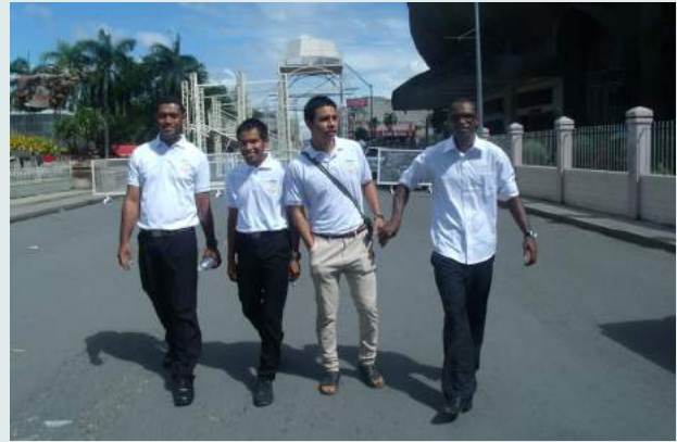
Taking a break after the 2017 Chrism Mass at St Pedro Cathedral.