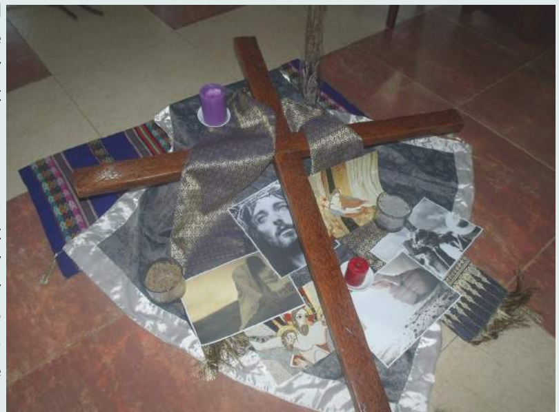
Our spiritual set up during the Faith Sharing: Our experience in Jesus' way of the Cross

Just to conclude Lent is about conversion, turning our lives more completely over to Christ and his way of life. That always involves giving up sin in some form. The goal is not just to abstain from sin for the duration of Lent but to root sin out of our lives forever. Conversion means leaving behind an old way of living and acting in a new way, embracing the new life in Christ.