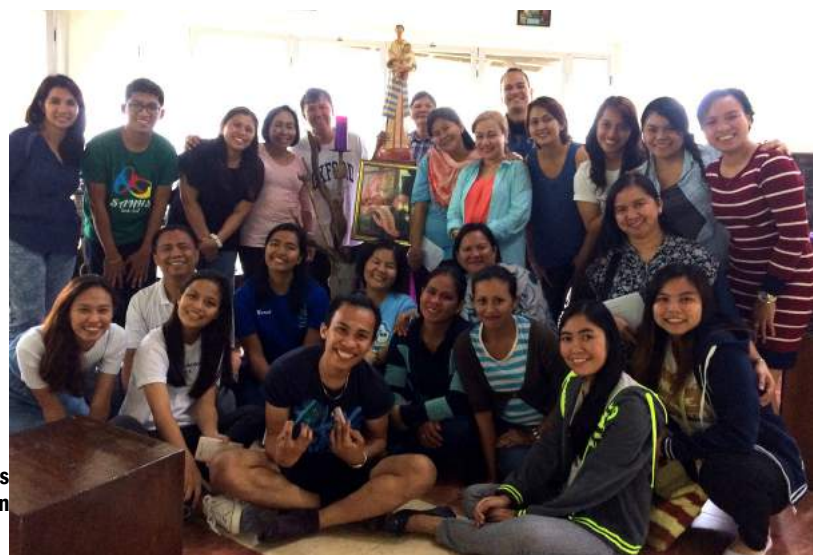
The Marist Laity after Mass Recollection