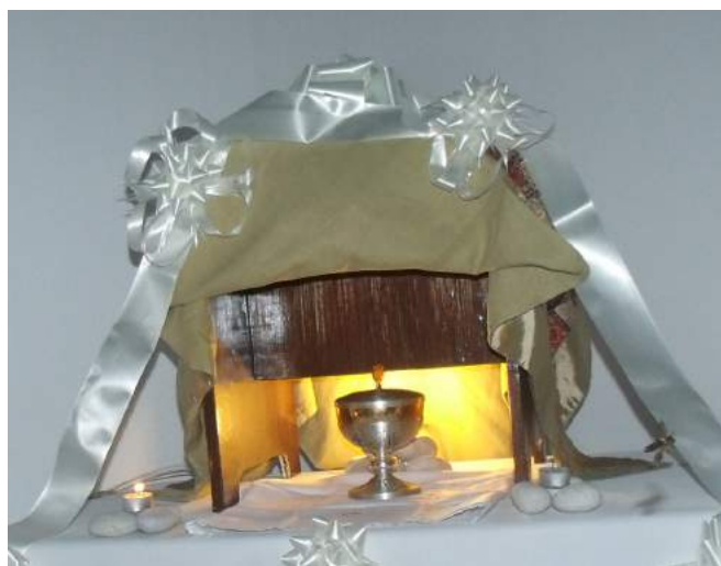
Tabernacle during Good Friday

"I listen to him and he listens to me; I talk with him and he interacts with me."