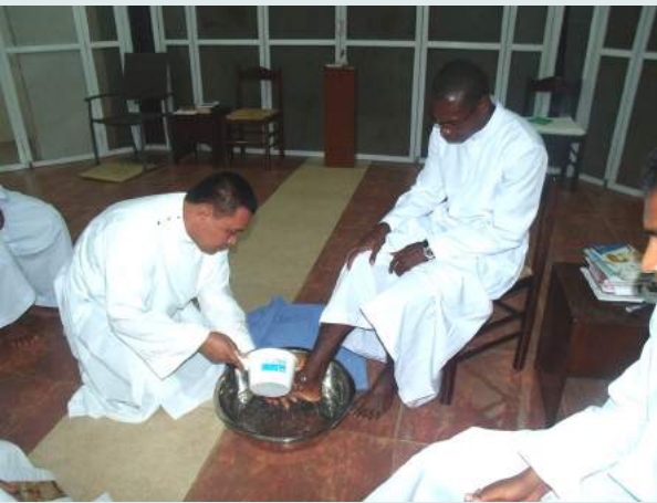
Lead by Examples.... Novice Master washed the feet of the Community.