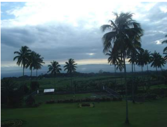
The view of Davao City from the Novitiate.