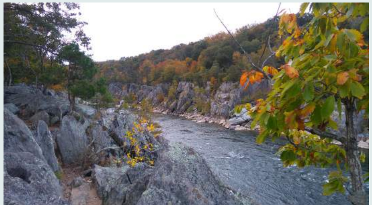
The land of freedom

Because there are reasons to cross the border: the certainty of a God with a heart of a Mother and Father, dead and risen, who walks with me, with us, with each one, among us: to enlighten those who live in darkness and in the shadow of death, and to guide our steps by the way of peace.