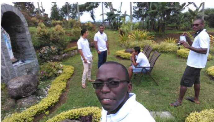
While rehearsing to be filmed.