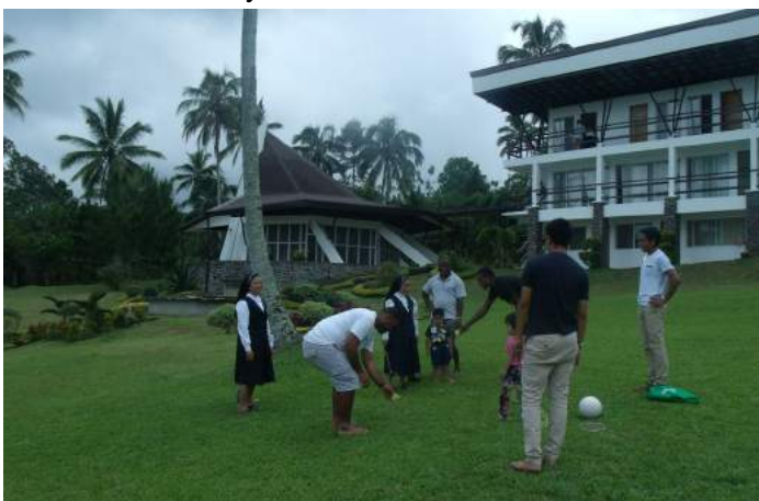
The visit by PM sisters with the orphans.

not I the person doing pastoral who is important but it is what the people get from me. The most powerful aspect here is that despite their age and condition, these people always teach new insight about the true meaning of life. Often they evangelize us more than we think. Though I am a religious Novice, I can never put myself above these people, because their lives reflect God's Love and goodness and I am only called to contemplate God in them.