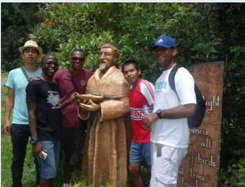
Novices with the statue of St Francis at Eden Park.