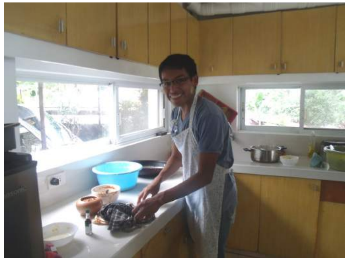
Mexican Taste for Sunday dinner.