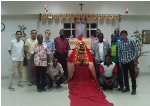
Farewelling the old Novices and welcoming of the new ones.