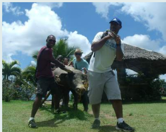
Once in a life time.... Novices pulling a Karabaw.