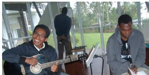
The two main guitarists ready for singing practice.