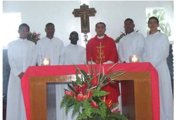
Opening Eucharist for the Opening of the Novitiate for 2017.