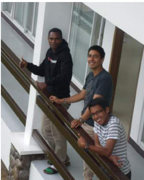
Nice smile after the Retreat .... A scene taken from the top of our house.